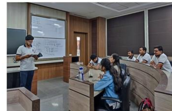
Photograph of the "Reading Session" organized on 29 April 2023.