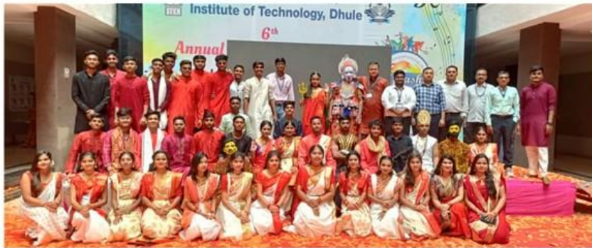
Glimpses of Mechanical dept. Representing West Bengal in Annual Social Cultural Gathering - Splash 2024. Dept. Won second prize in state representation.