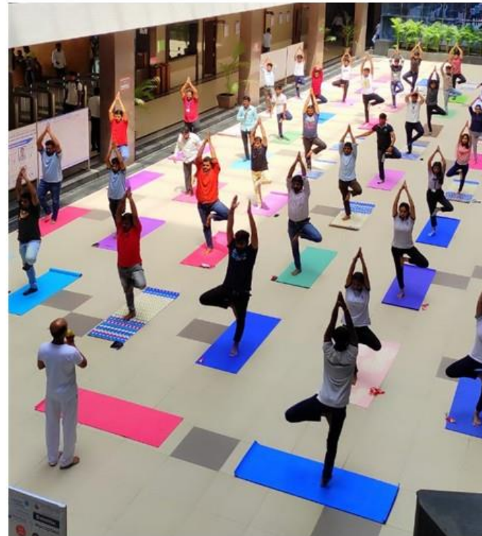
Students Performing Yoga on the occasion of Yoga Day 2023