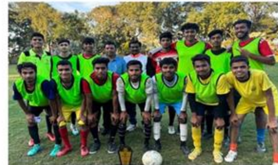
Photograph of the Football Team at the University level