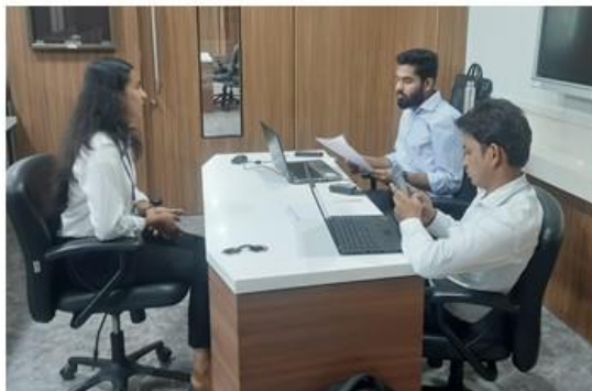
Photograph of the mock interview conducted on 1 June 2023