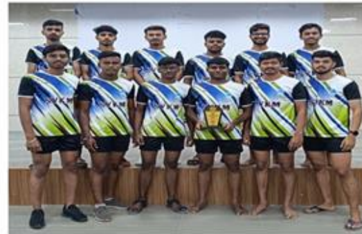
Photograph of the Kabaddi Team at the University level