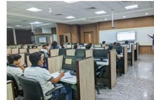
Glimpses of the students attending "Campus credential" sessions at the computer centre.