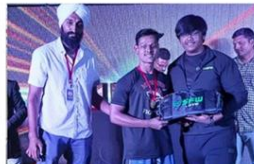
Photograph of the Tejas Sonar receiving Gold Medal at National level in the Mix Martial Arts