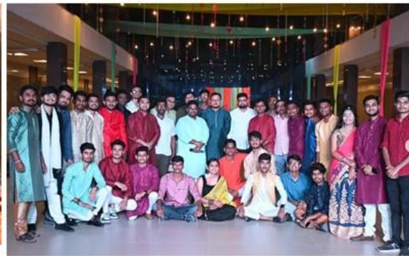
Glimpses of Mechanical dept. Celebrating Garba night