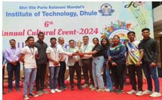
Photograph of the Mechanical dept. Receiving Annual sports championship

Outstanding performance in sports activities