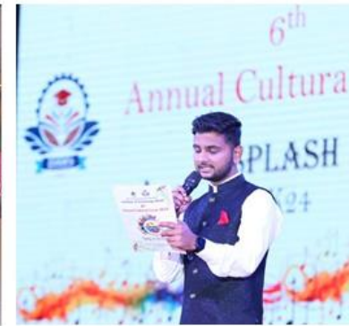
Participation of students in Annual Social Cultural Gathering - SPLASH