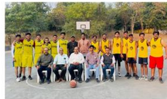
Photograph of the Basketball boys winning team