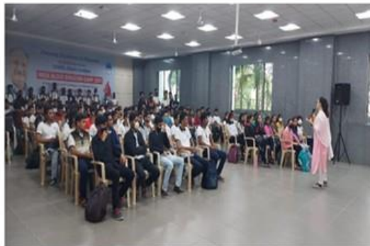
Glimpses of the Seminar on "German Language" organized on 8 Dec. 2021