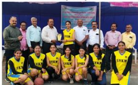
Photograph of the Girls Basketball team at the University level